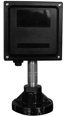
Optional Nema 6P Adapter for Remote ER420