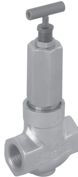
Type SMV Valve