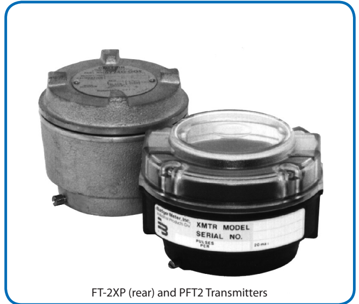
FT-2XP (rear) and PFT2 Transmitters

Typical applications would be chemical batching systems, chemical additive systems and other applications that require totalizing meter flow and monitoring rate of flow of fluid passing through the flow meter.