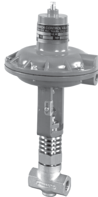
Shown with Type 754 Actuator

Accessories Filter regulator, gauges, I/P converter, limit switches, handwheel, solenoids