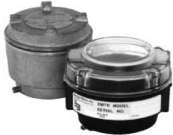
MSE5XP (rear) and PM5 Transmitters

These transmitters are used in metering systems that require pulse closures for recording rate of flow, quantity of flow, liquid feeding, blending and batching.