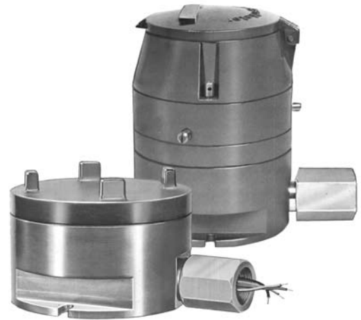
MS-E1 Pulse Transmitter (Front) MS-ER1 Transmitter / Register (Back)

Typical applications include liquid feeding, blending and batch control.