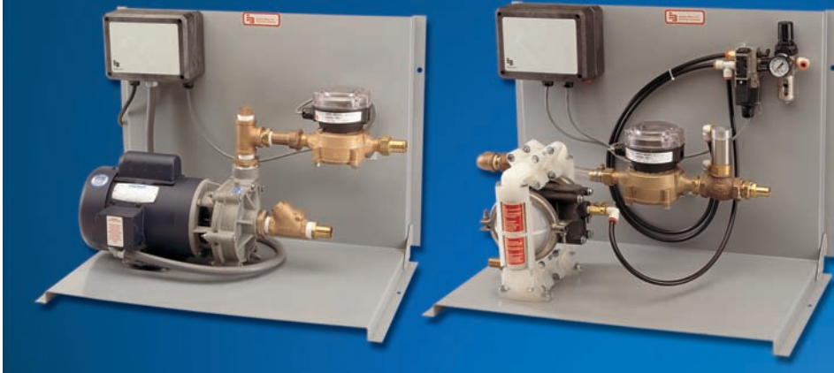
Direct Feed Dispensers

Badger's outstanding line of chemical admixture dispenser products have been engineered using time-proven design techniques. You can rely on Badger® quality to deliver consistent, accurate and dependable systems performance under the most rigorous conditions. You can also count on Badger® for the technical support, training, and service you need to keep the production in your plant operating at optimum levels, day in and day out.