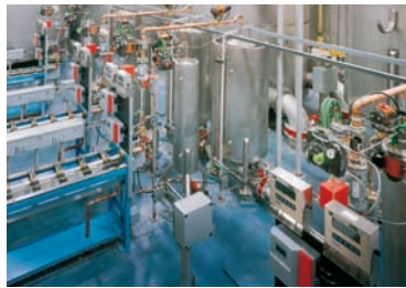
Hydro Lab in Badger Meter's James O. Wright Innovation Center

You are never far from Badger's knowledgeable customer support team. They are ready to answer your questions and to find the solutions you need without delay. Simply call the Badger representative nearest you — or check out our web site to send us an e-mail. Badger maintains a large product inventory, ready for immediate shipment, so your plant can maximize its valuable production time.