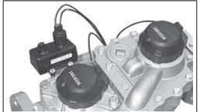
Figure 1. Summator models mounted to RTR Recordall Compound Register

All of the connection components have alignment keys to assist in the assembly process. The cable entry into the connector is sealed with a polyurethane potting material. The connector halves are sealed to each other with an O-Ring. Grease is used to fill the interior connector cavity to prevent contact corrosion. The connector halves are locked together with a 1/6" turn of the Lock Band. When turned and locked into this final position, it can no longer be rotated to the unlocked position. It can only be removed by breaking it at one of its score marks with a screwdriver or similar tool. The connector can be reassembled with the use of a new Lock Band.