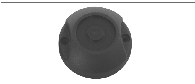
Figure 2. BadgerTouch Remote Module - Front View