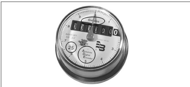
Figure 1. Identification - Absolute Digital Encoder

BadgerTouch Remote Modules are supplied as stand alone modules for field connection to Absolute Digital Encoder (ADE™) for all Recordall® Disc, Turbo Series and Compound Series Meters. Each ADE is clearly identified on the face of the dial with an assembly number, unit of measure and meter model number (See Figure 1). The BadgerTouch Remote Module does not contain an identification number. The ADE register contains a unique identification number. The number is shown on the underside of the register cover. Interrogation of the ADE will display the ID number and the meter reading.