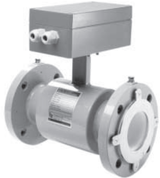
7500P Concrete Mag Meter

Magnetoflow® 7500P operation is not affected by a moderate presence of most suspended solids in the liquid, as is the case in concrete reclaimed water. Variations of liquid temperature, viscosity or density have no influence in its principle of operation. A set of convenient, field proven pulse scaler rotary switches are provided for easy and straight-forward batch accuracy compensation.